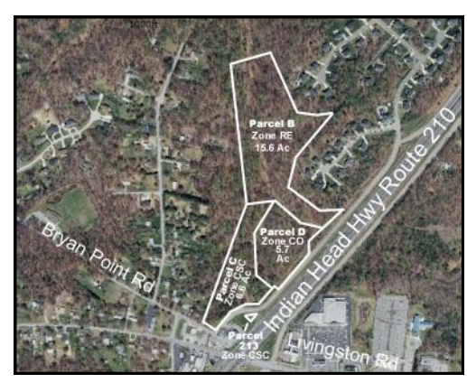
15911 Indian Head Highway Accokeek, Maryland $750,000

Total Acreage: 28.16 Use potentials: Medical/Office Complex, Church and School Site Zoning: CSC-6.78 ac; CO-5.96 ac; RE-15.64 Ac Recorded Plat and Ready for Development! Click on the photo for more information!