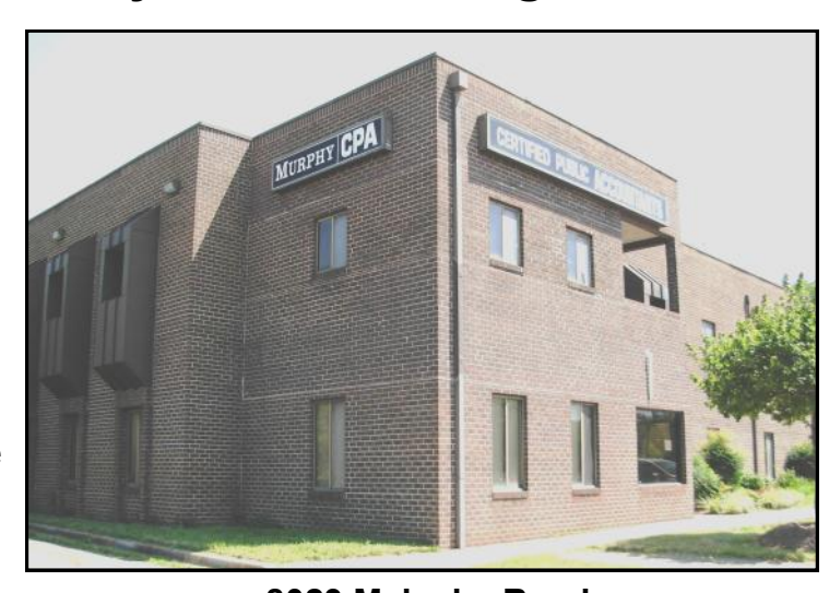
8023 Malcolm Road Clinton, Maryland $1,550,000 Owner will look at all Proposals! Click on the photo above for details!

We have smaller, separate buildings available.