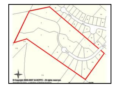
8100 Rison Drive Brandywine, MD Ready to Grade! $512,000 or $32,000/lot

Total Acreage: 24.29 Click on the drawing for more information!