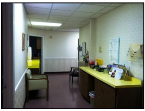
Reception Area; Waiting Room; Administrative Office; 2 Exam Rooms; 2 Labs; and 2 Restrooms.