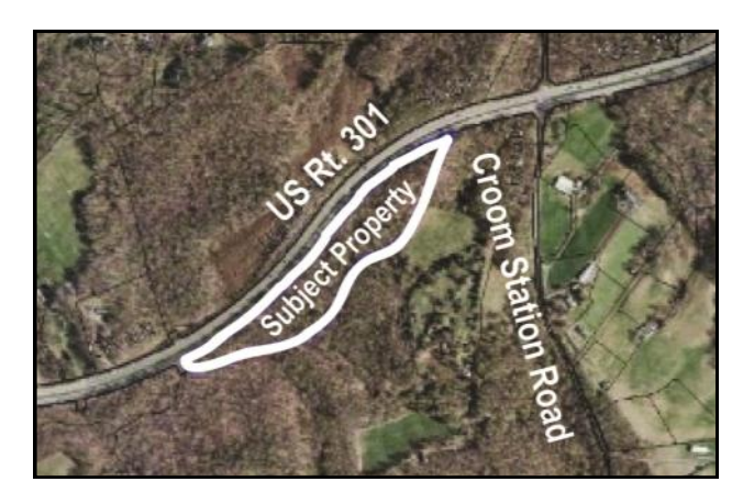
6900 Crain Highway Upper Marlboro, Maryland $199,000

Nearly 15 acres and a great opportunity for a home-based business at a crossover on Route 301. The site is located on the northbound lane of Route 301, approximately 1 mile north of the intersection with Croom Road, and less than 1.000 feet from Croom Station Road.