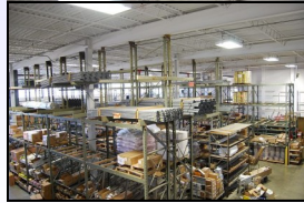
2ND FLR-41,400 S.F. Vacant Now!