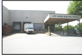
2ND FLR-Loading Docks and Entrance