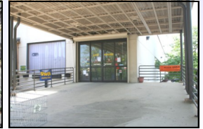
2ND FLR-Covered Ground Entryway

CAPITAL TAX GAIN COSTS WILL INCREASE IN 2011 BY 60% OWNERS MUST SELL THIS YEAR . . . "NO REASONABLE OFFER REFUSED!"