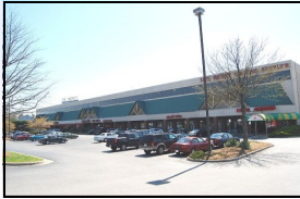
FRONT VIEW Shows Well!

91,910 s.f. Center. THREE levels! Built 1990. New roof in 2008. At Allentown Rd & Rt 5, one traffic light from Rt. 495. Second floor—Two Stories High! Ground level entrance, approx. 41,400 s.f. available for lease. Third Floor approx. 12,260 s.f.. Future expansion of third floor (approx 7,716 s.f.) would be perfect for choir loft! Third floor office space (4,450 s.f.) for lease. Long term tenants in place! CLICK FOR MORE INFORMATION