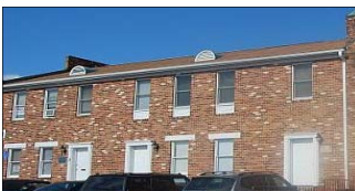
MOVE IN TODAY!