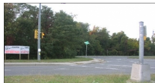
CORNER STOP LIGHT